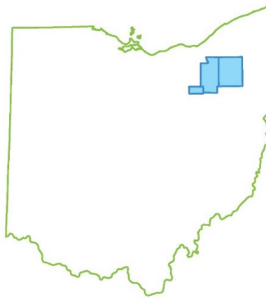
The AMATS Area within the State of Ohio

The 1962 Federal Aid Highway Act created metropolitan planning organizations (MPOs), such as AMATS, in keeping with the requirement that urban areas have a defined planning process to receive federal aid for transportation programs and projects.