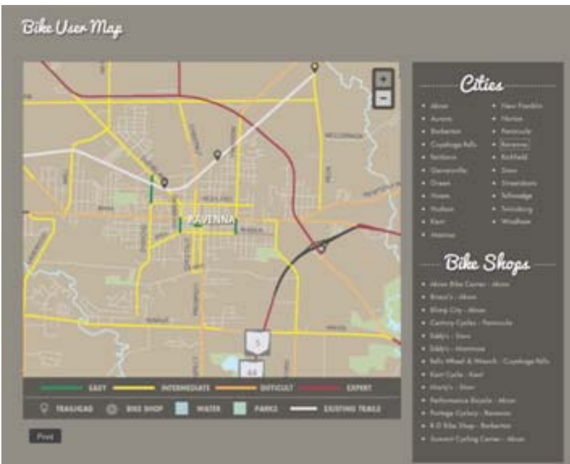
Clockwise from top left: interactive discussion forum; comprehensive calendar of events from all area clubs and groups; interactive and searchable Bike User Map.