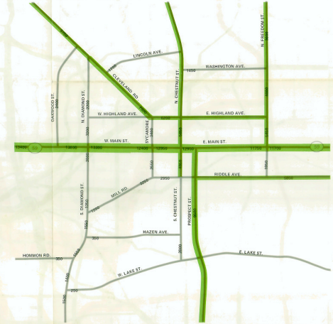
RAVENNA / One inch equals 50,000 vehicles per day