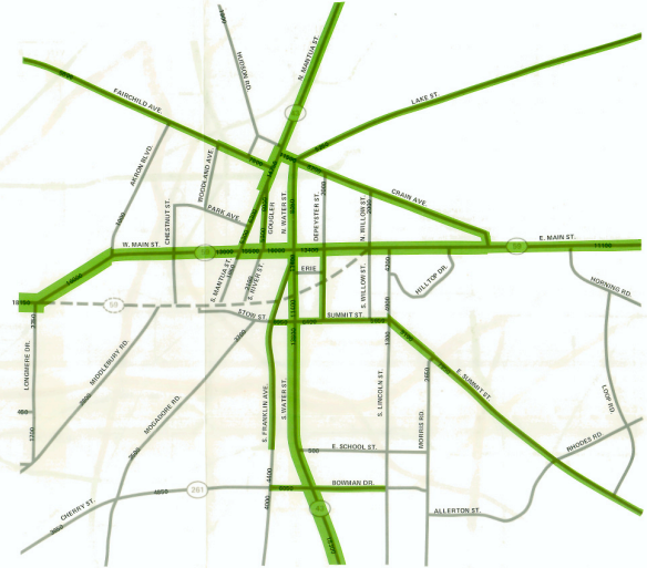
KENT / One inch equals 50,000 vehicles per day