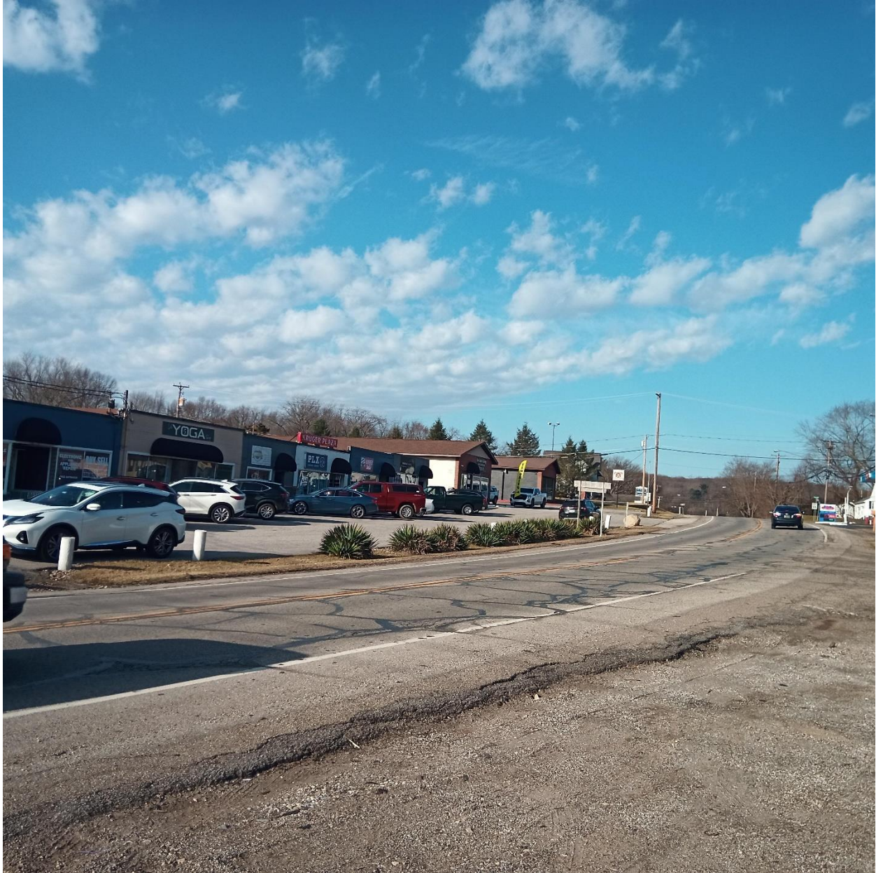
Existing light commercial frontage with limited access management, sidewalks, and bicycle facilities.