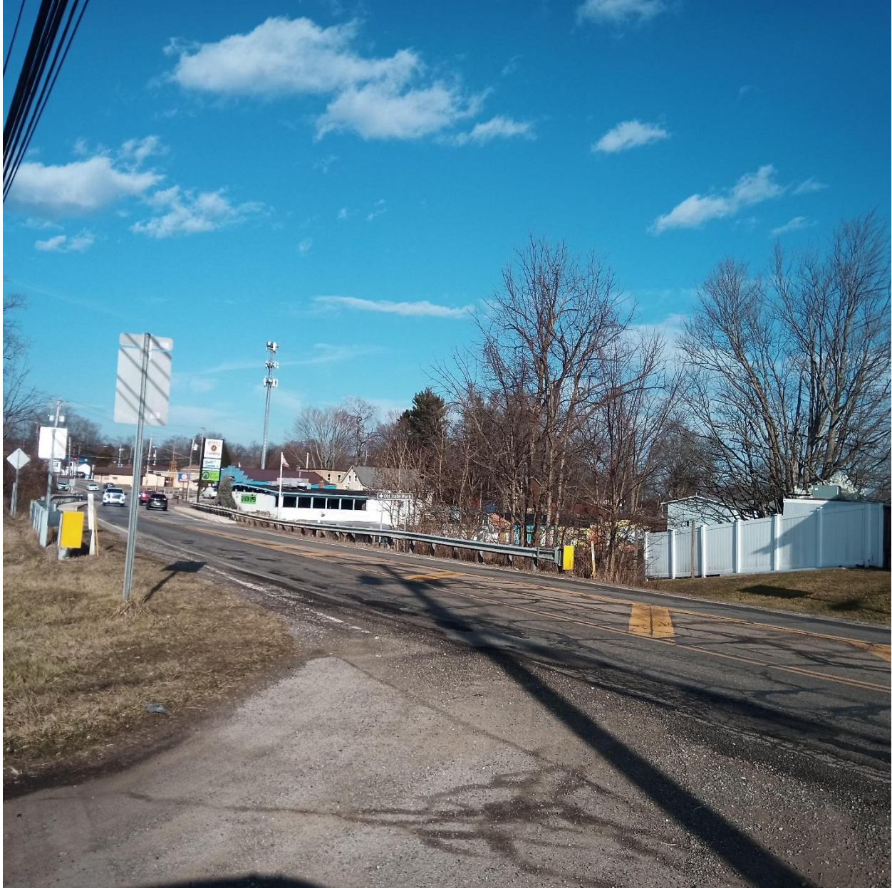
Lack of pedestrian or bicycle facilities to connect both sides of the channel. Pedestrians and cyclists must share a narrow bridge with vehicles when trying to cross channel.