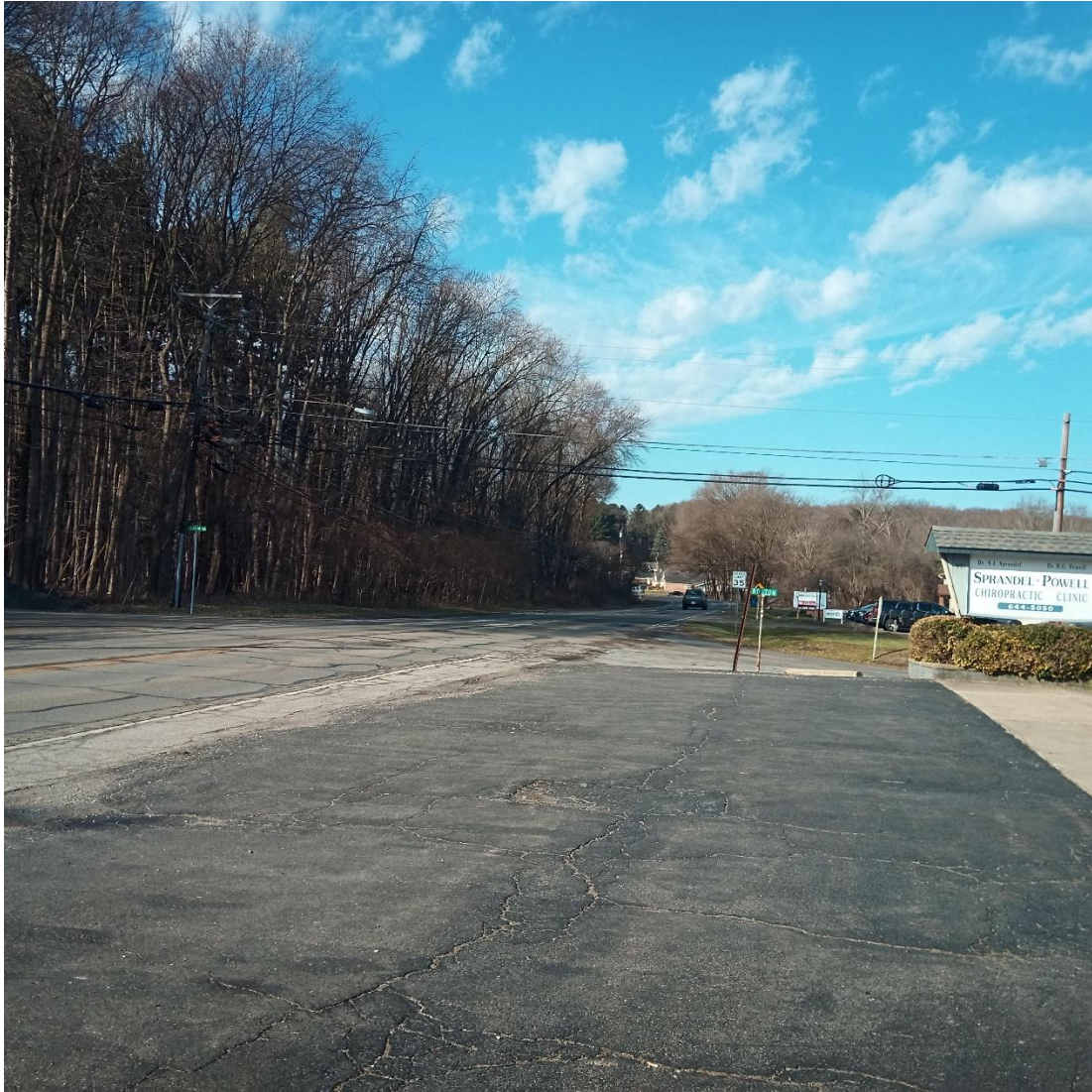
Example of limited access management control on SR 619 and lack of pedestrian and bicycle facilities.