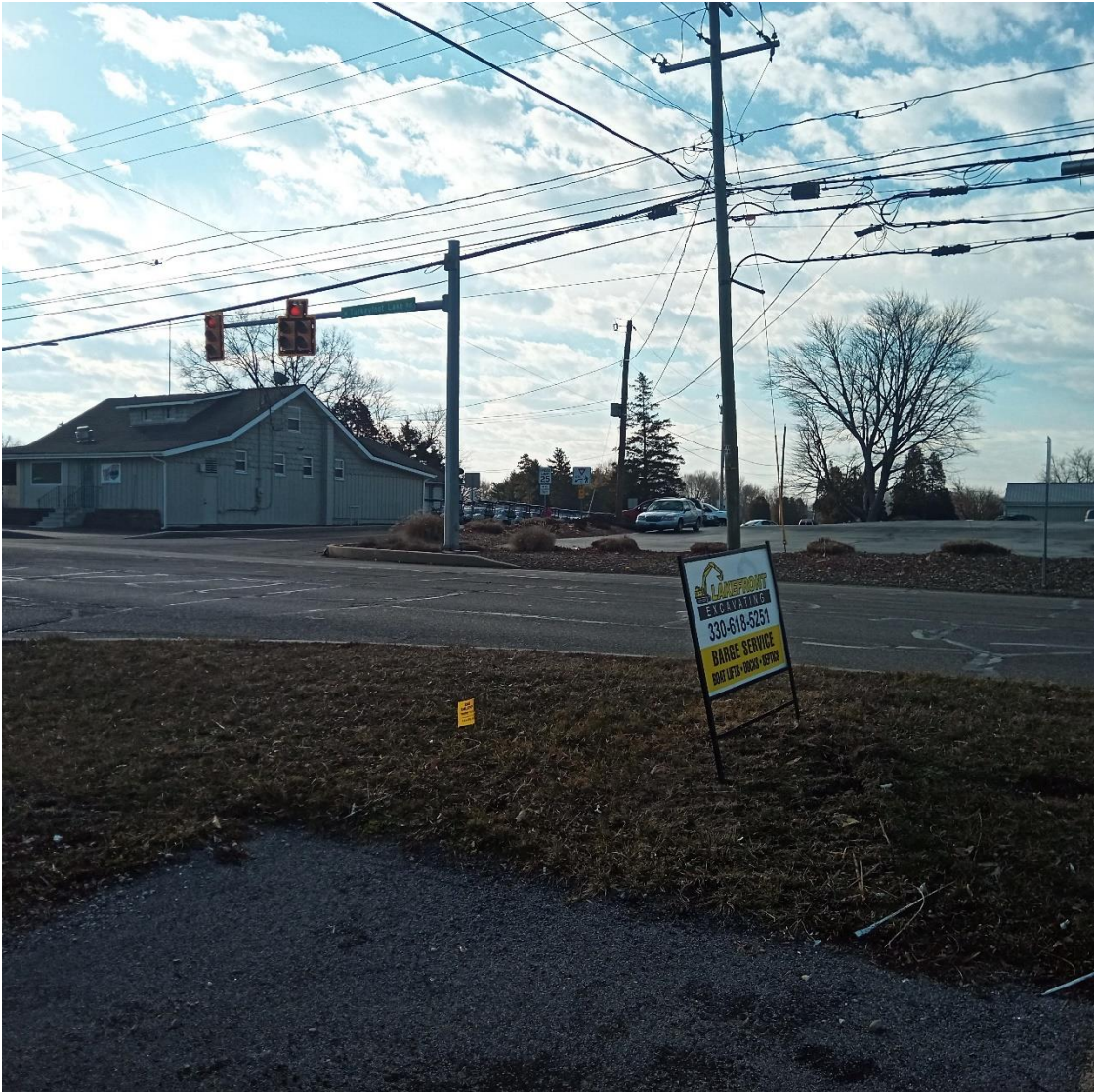
Lack of sidewalks and crosswalks for pedestrians crossing the SR 619/South Turkeyfoot Road/Point Comfort Drive intersection.