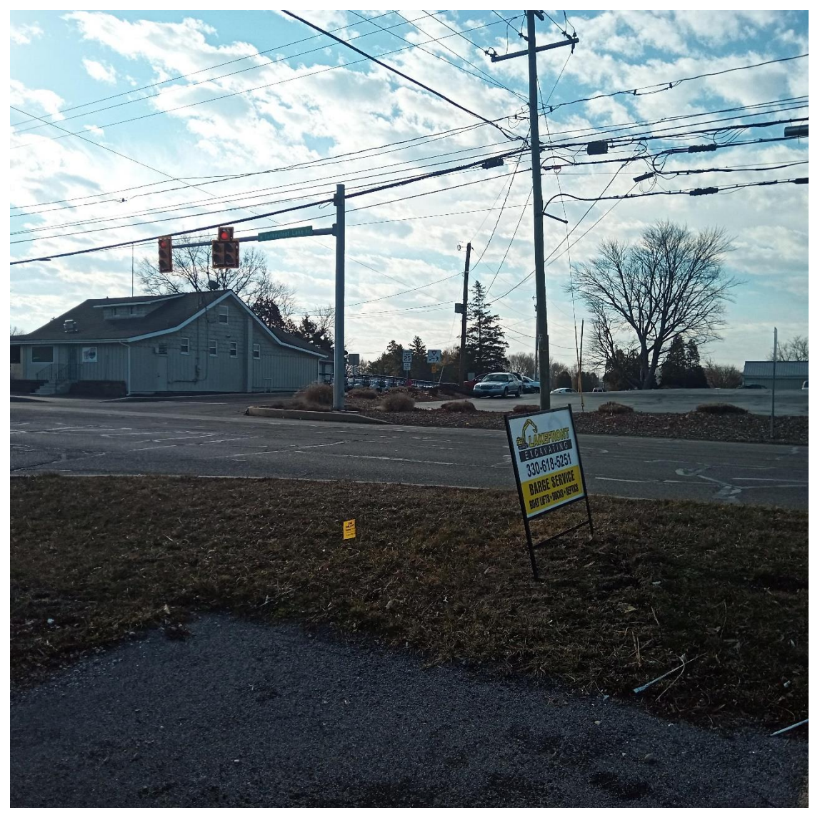
Lack of sidewalks and crosswalks for pedestrians crossing the SR 619/South Turkeyfoot Road/Point Comfort Drive intersection.