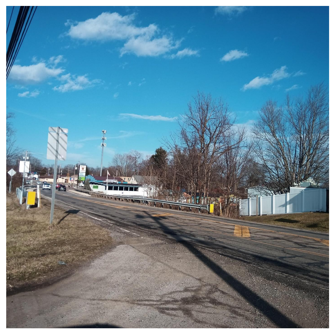
Lack of pedestrian or bicycle facilities to connect both sides of the channel. Pedestrians and cyclists must share a narrow bridge with vehicles when trying to cross channel.