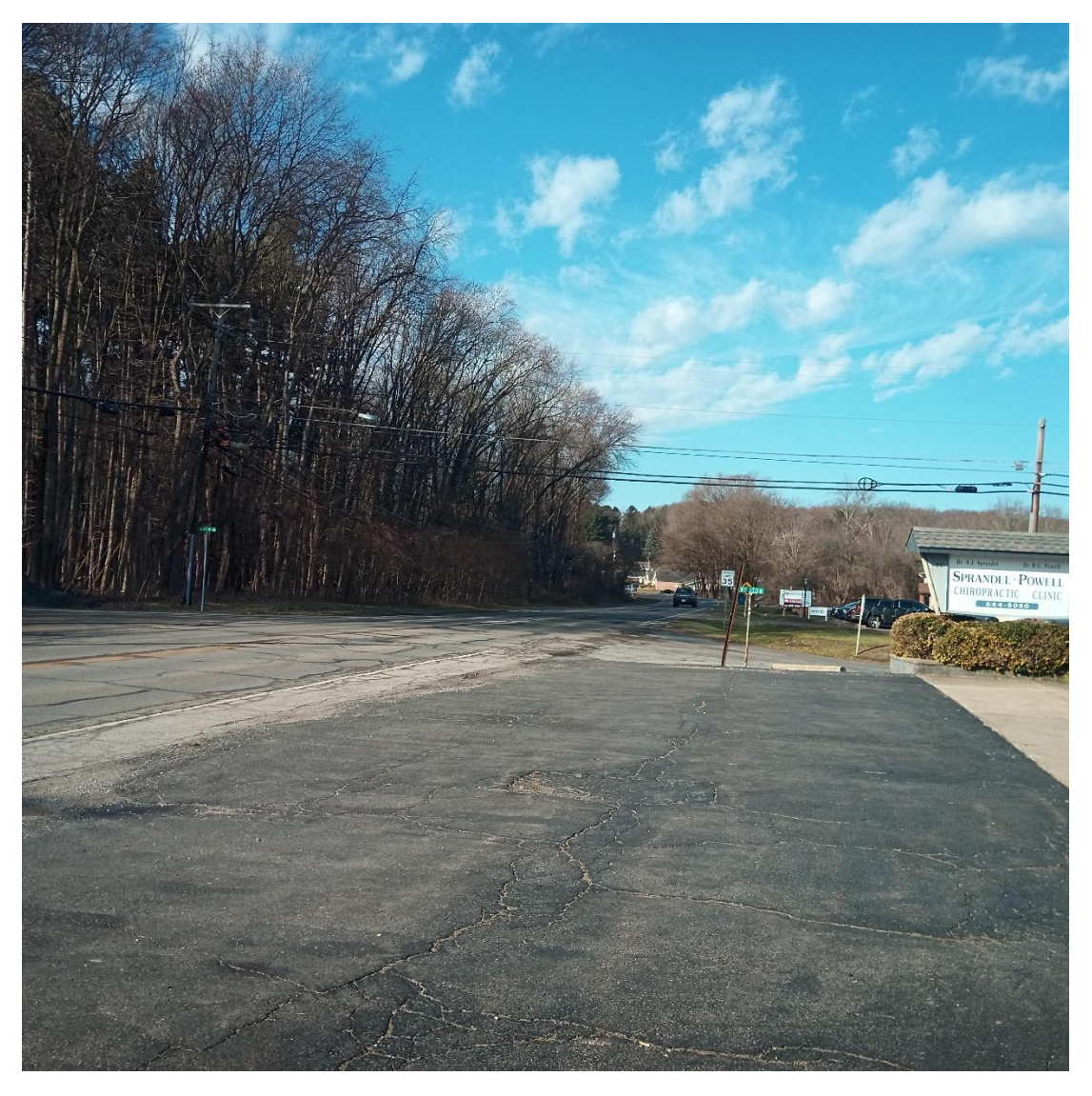
Example of limited access management control on SR 619 and lack of pedestrian and bicycle facilities.