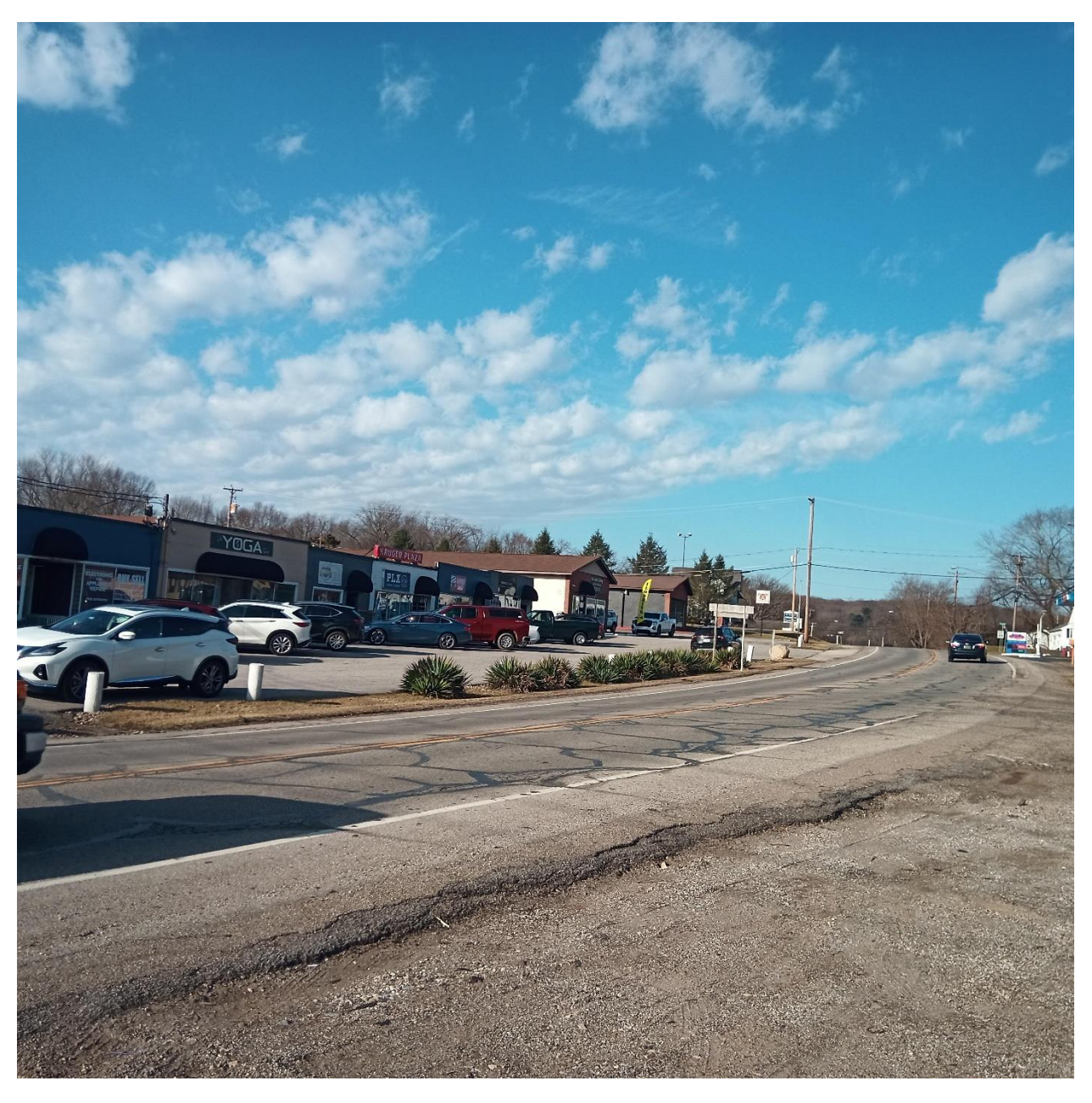
Existing light commercial frontage with limited access management, sidewalks, and bicycle facilities.